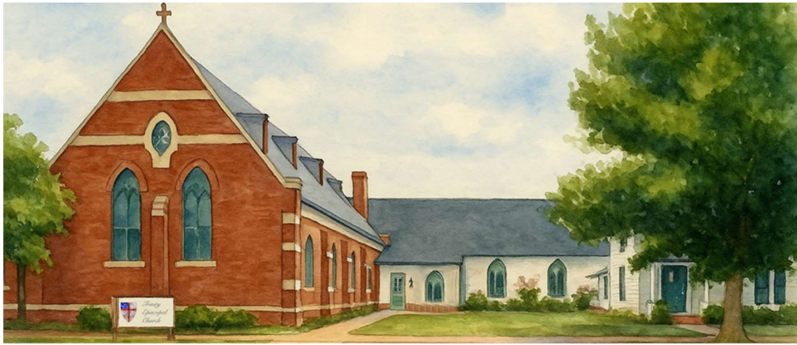
TRINITY EPISCOPAL CHURCH GUTHRIE, OK