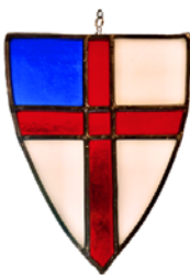
TRINITY'S STAINED-GLASS: BROOKE HALL DOOR ORIGIN UNKNOWN

CONNECTICUT (1783) MARYLAND (1783) MASSACHUSETTS (1784) PENNSYLVANIA (1784), NEW JERSEY (1785) NEW YORK (1785) SOUTH CAROLINA (1785) VIRGINIA (1785) DELAWARE (1786)