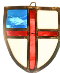
TRINITY'S STAINED-GLASS: NARTHX ORIGIN UNKNOWN

CONNECTICUT (1783) MARYLAND (1783) MASSACHUSETTS (1784) PENNSYLVANIA (1784), NEW JERSEY (1785) NEW YORK (1785) SOUTH CAROLINA (1785) VIRGINIA (1785) DELAWARE (1786)