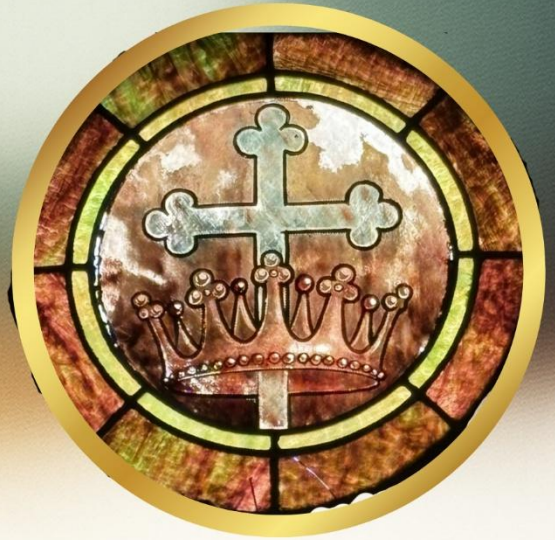
Stained Glass Window Southeast In Nave