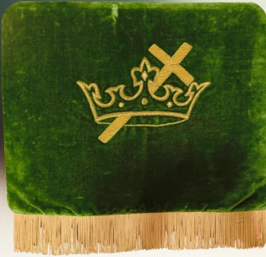
One of the oldest Lectern hangings at Trinity