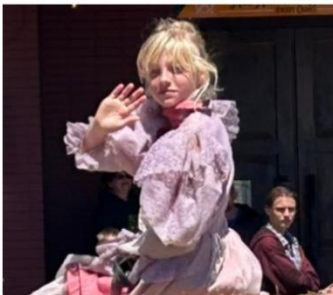
The Lissy Family